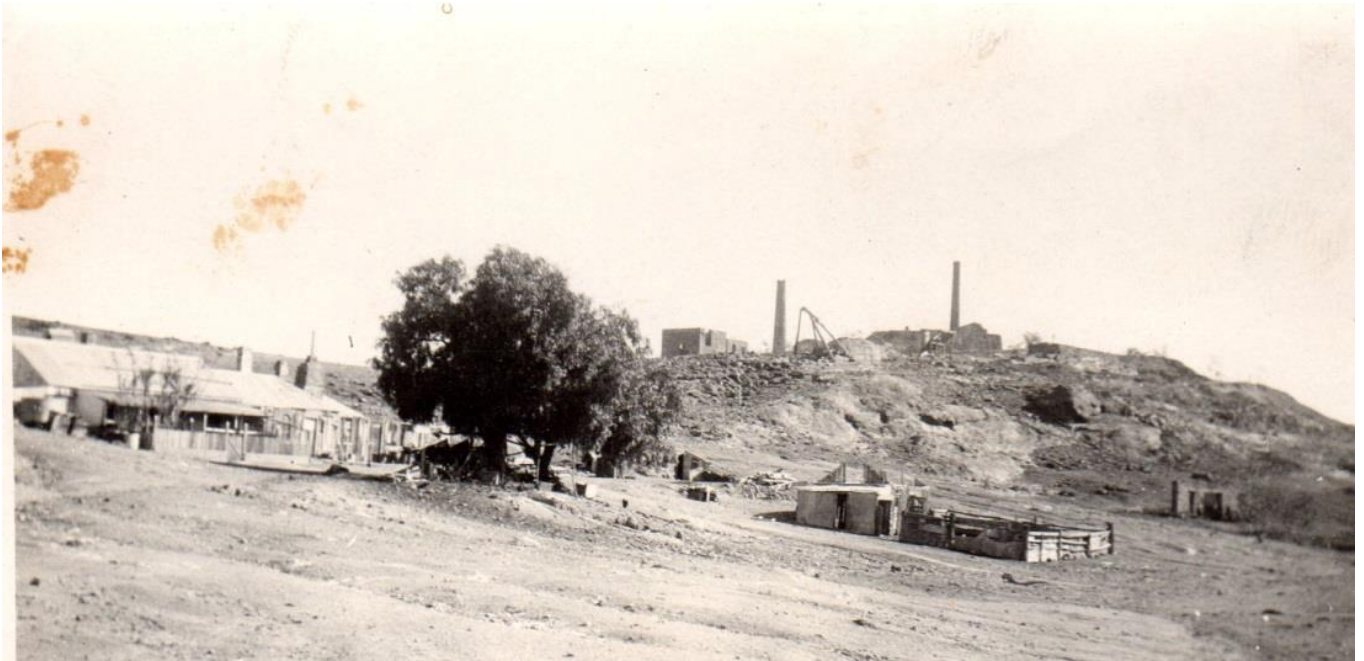
Photos taken of the Mine Captains cottage, one with the mine in the background and one with the town of Blinman in the background