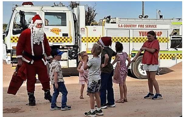
Santa arrived by fire truck