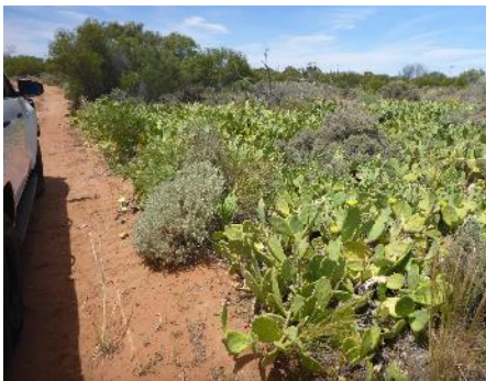
Before and after cochineal application to cactus

A new date has been set for the rescheduled Koonamore Stickybeak Day and it's one to add to your diaries. The event, to be held on Tuesday 21 March , promises a great program of soil-related talks and activities.