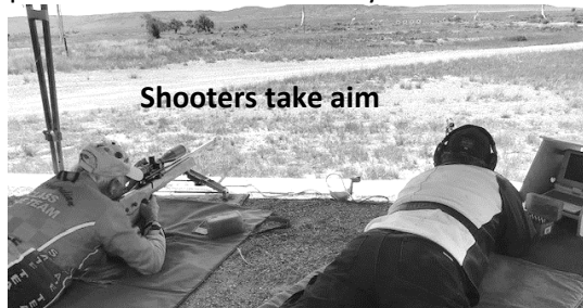
Shooters take aim