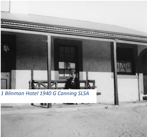
1 Blinman Hotel 1940 G Canning SLISA