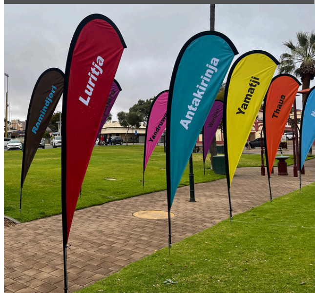
A small selection of the flags representing some of the Aboriginal nations of people living in Port Augusta.