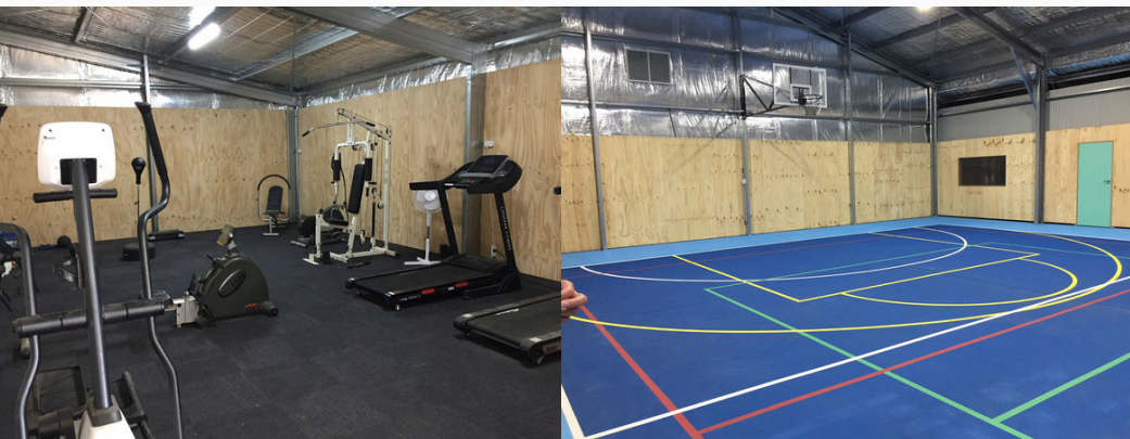
The Andamooka Rec Centre has a range of sporting and fitness facilities and will be expanded to support cultural, artistic and other community activities.