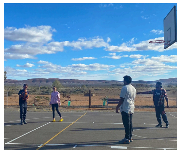
The basketball court is a hit with young people in the town