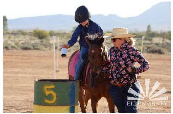
Led Can Race