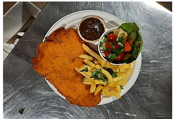
How delicious was the evening meal?!