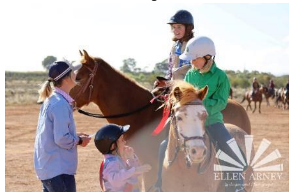
The Crawford girls of Weekeroo