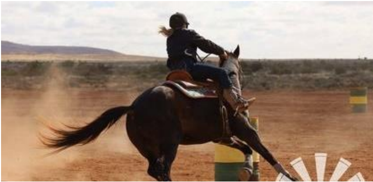
Texas Barrel Racing