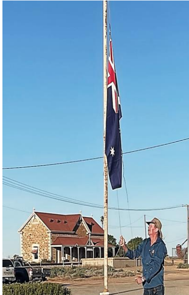
Allen Hucks raises the flag.