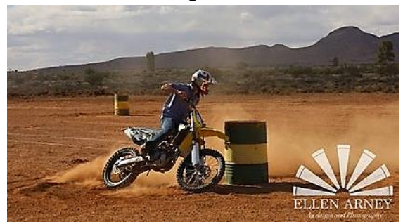
Motokhana Barrel Racing