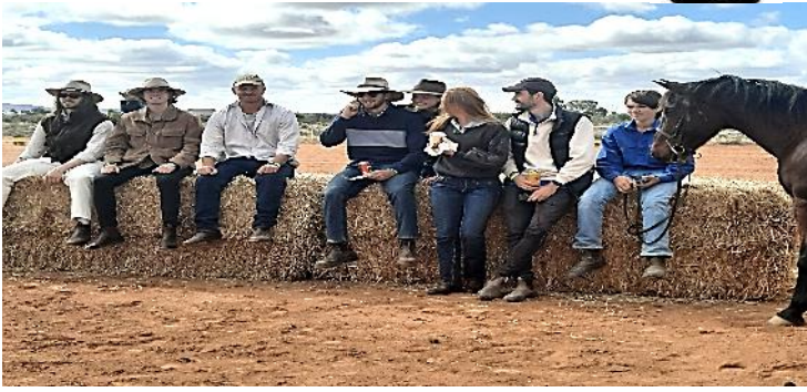
The Paratoo mob