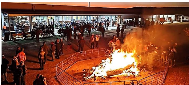
The After Party campfire