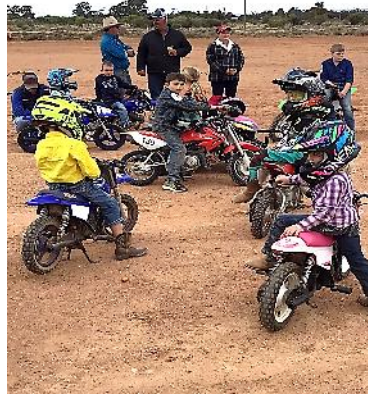
Mini motor cyclists