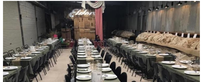
The stunning Wool Show venue