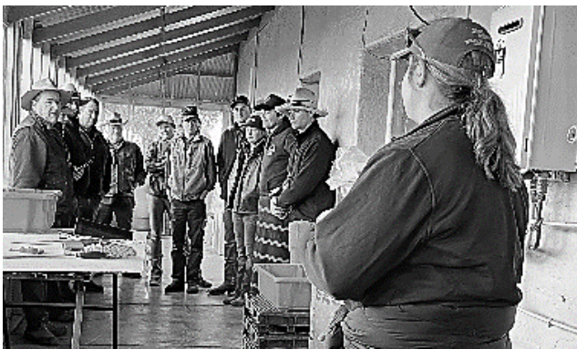
Some of the Mutooroo 'meatworkers'.