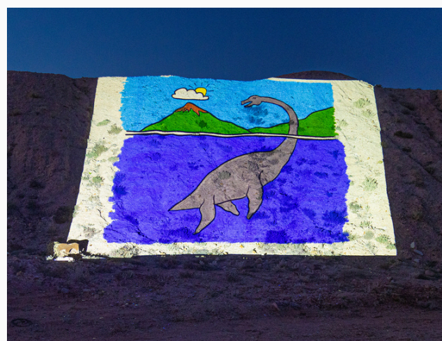
Images: (banner) The inflatable plesiosaur was a hit in the evening parade. (top) Ramsey from Roxby Downs got a great dowsing in the Colour Run. (above) Fossil-related artworks were projected on the hill behind the parade.