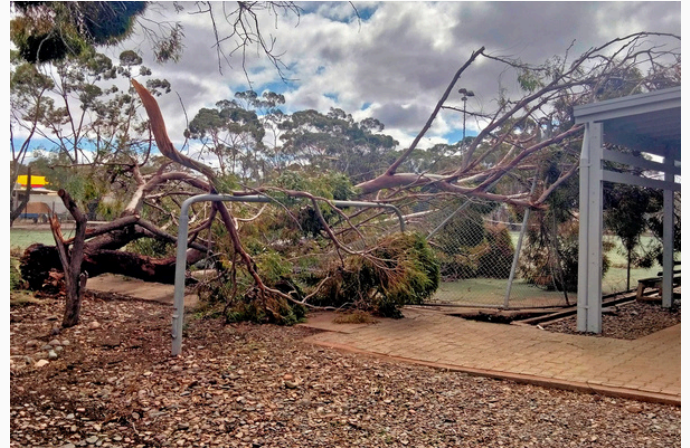
Images: The damage around Leigh Creek has been extensive.