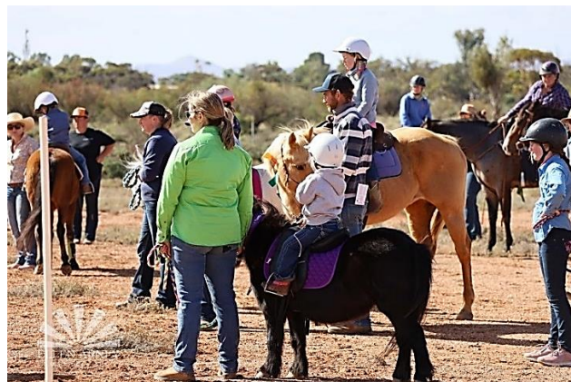
Young riders at the start line