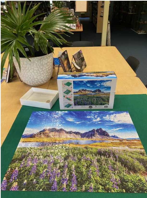
At long last the Leigh Creek Library puzzle has been completed!