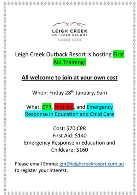
First Aid Training will be available at the Leigh Creek Outback Resort on Friday 28th January.