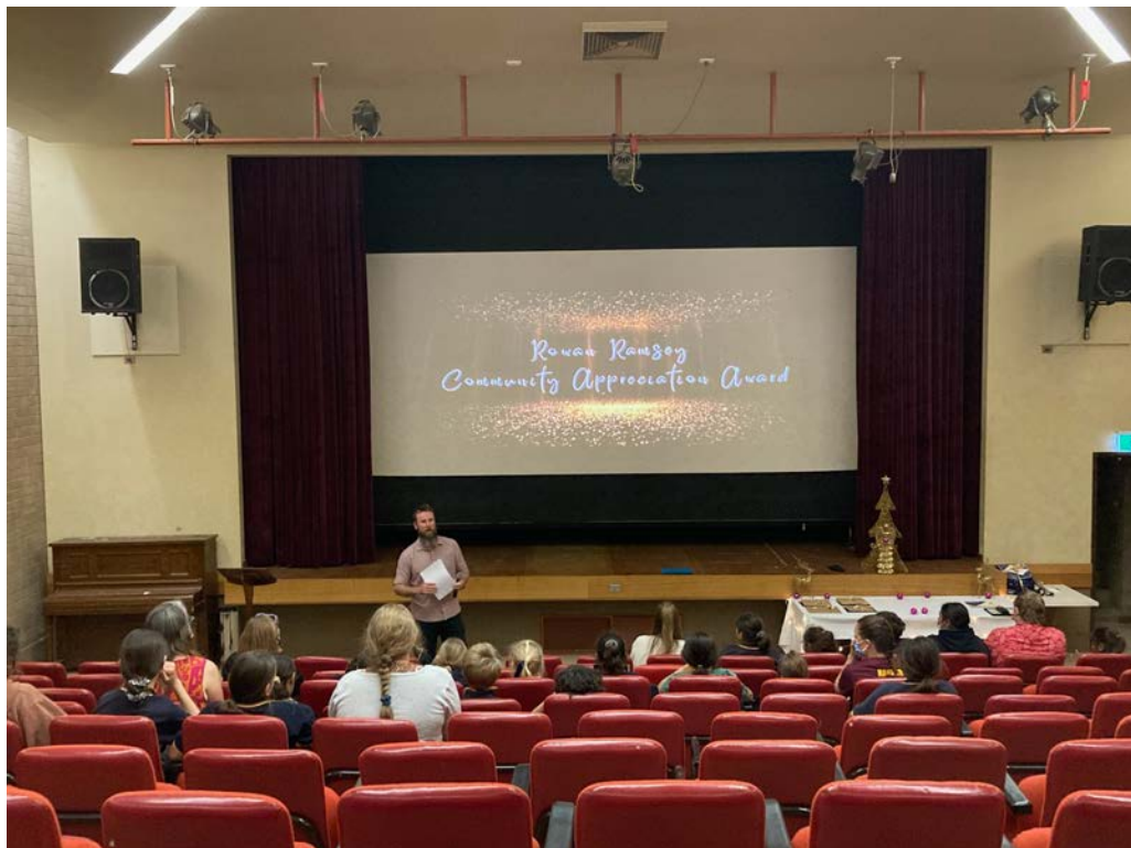
A big congratulations to all of the students who received awards at this years End Of Year Assembly!