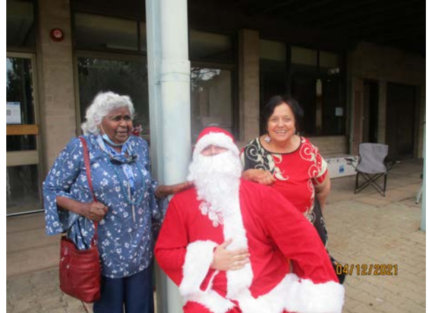
Father Christmas arrived to distribute gifts for all of the children

What a fantastic turnout for the Leigh Creek and Copley Progress Associations Christmas Party. The kids had fun playing games on the oval, getting their faces painted and enjoying a delicious BBQ. Father Christmas made an appearance to give out some presents to the children before singing some festive carols.